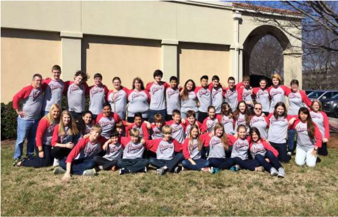
Grace Youth Ministry at the NC Lutheran Youth Organization Synod Assembly in February