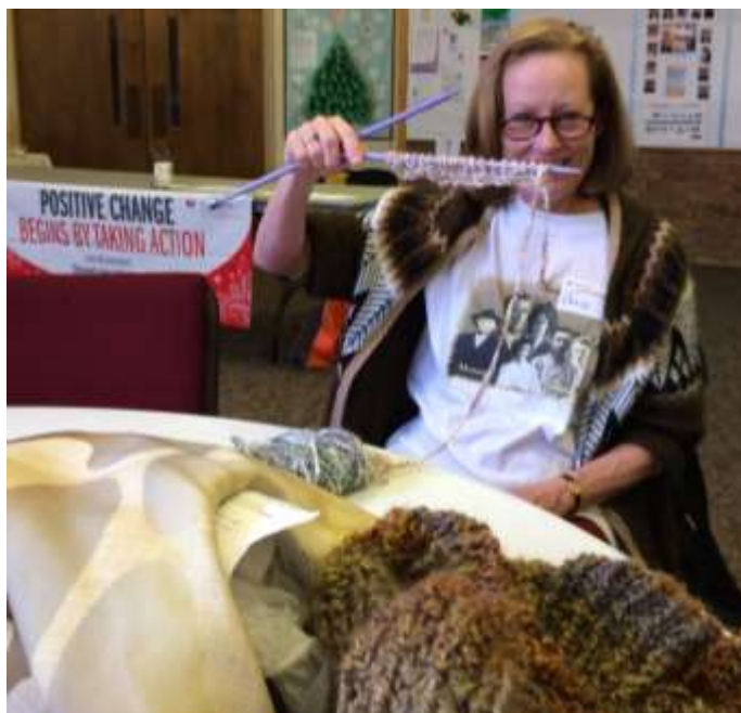
Learning to knit at the Prayer Shawl Workshop

Our bulletin board is located in Fellowship Hall under "Adult Ministry." Events and sign-up sheets will be located there. The OWLs is a fellowship group open to adults of all ages. This is a great place to meet members of Grace!